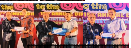
Guest Lucky Draw