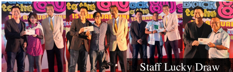
Staff Lucky Draw