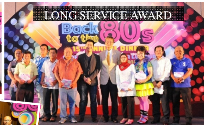
LONG SERVICE AWARD